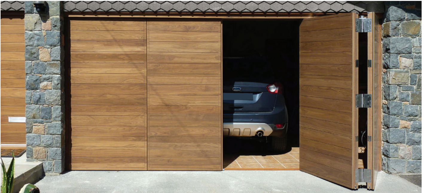
triple up-and-over rondo automated garage doors / iroko / stainless steel inserts