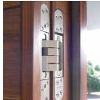
3D concealed hinge