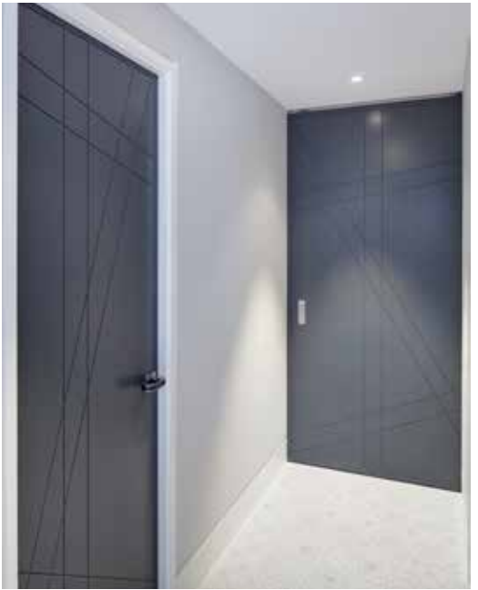
root hinged painted in RAL 7011