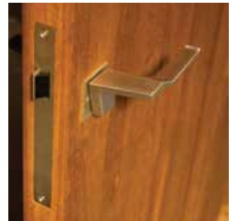
internal door latch