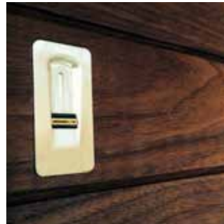
integrated fingerprint system (optional)