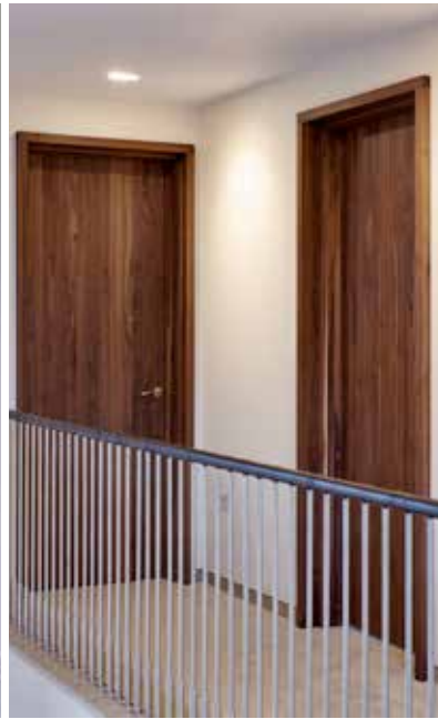
lever handles / handle option 2