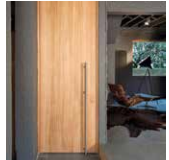
g lock handle (optional)