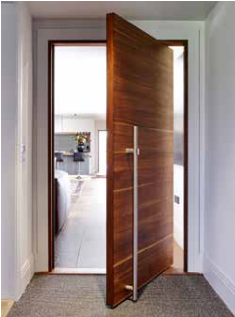
raw oversized pivot in american walnut